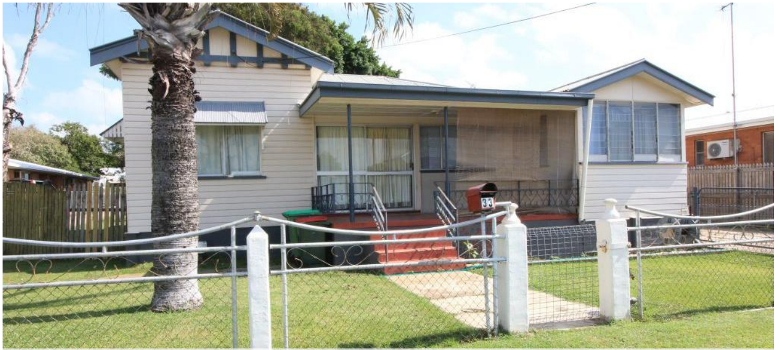
33 Munro St, Ayr